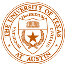
University of Texas, Austin