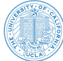
UC - Los Angeles